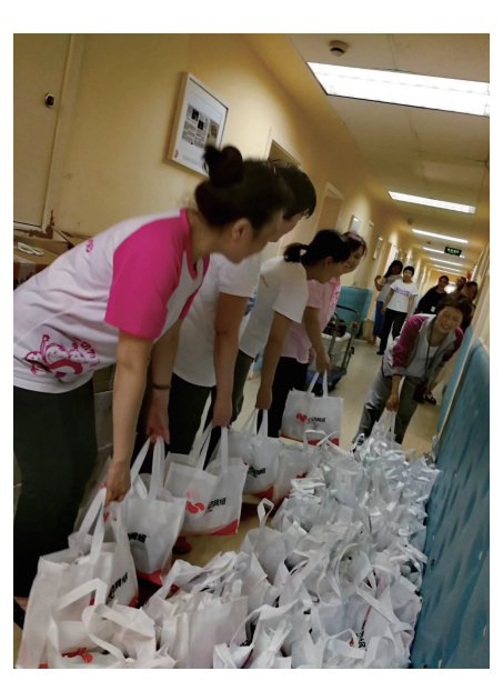
Donation to children's welfare home — Home of Babies

With the mission of "creating growth opportunities for employees", the Group developed the Training Management Policy , and provides training and development opportunities for all employees to help them maximise their potential. The human resources department of the Group makes training plans and organises employees to participate in 6 types of training courses covering general skills, technology, arts, application, planning and management, so as to help them improve their professional skills and comprehensive working capabilities. In 2019, we held 46 training sessions with a total training time of 114.5 hours.