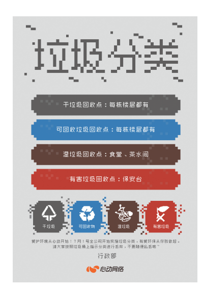
Waste classification management